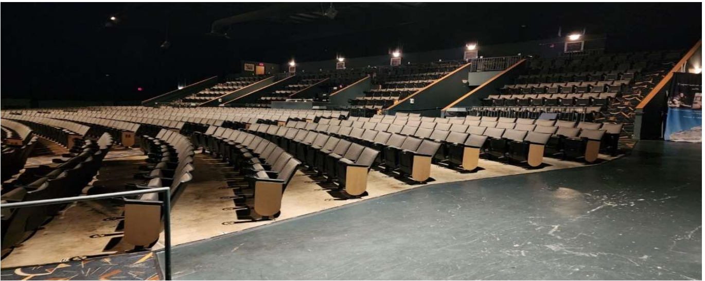
DONATED SEATS FOR HALL RIALTO THEATER TO BE INSTALLED BY JANUARY 21, 2024

Please help raise the money to install the below seats.